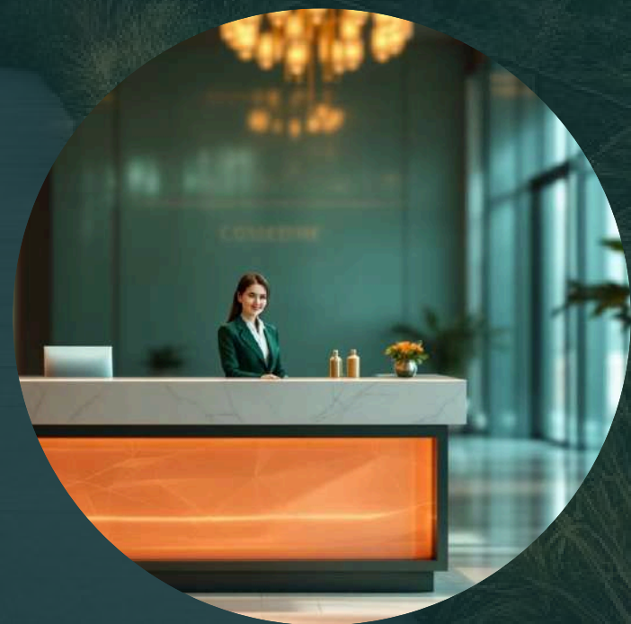
Service & Security 24/7 security and concierge