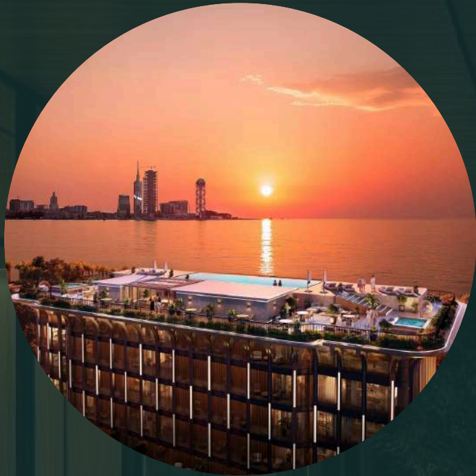
Rooftop Pool Relax and unwind

Experience luxury living: expansive green spaces, infinity pool, gourmet restaurants, and high-end shopping.