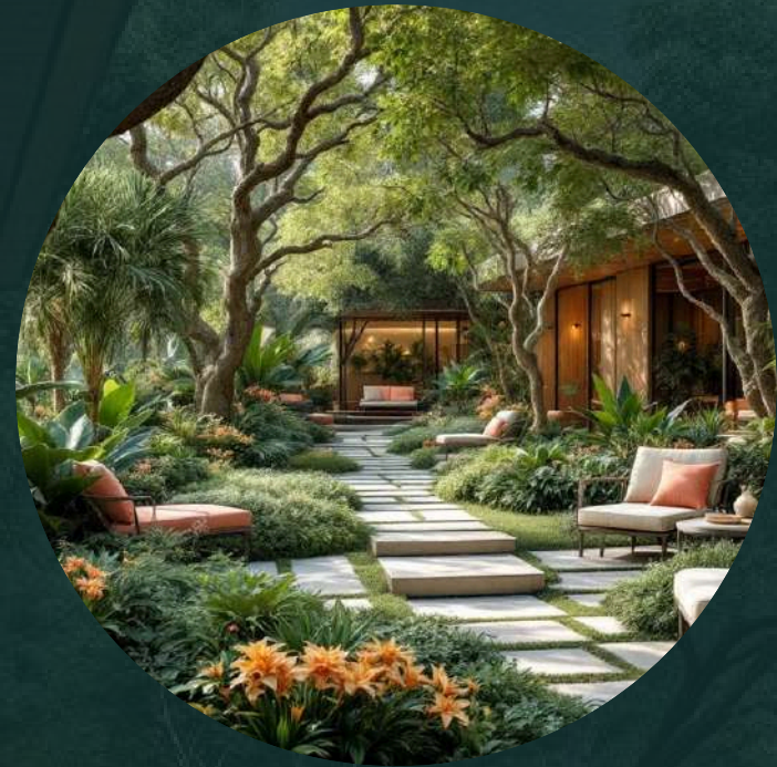
Recreation Zone Private garden access